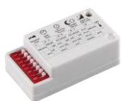
Microwave Sensor (Mounting height ≤8.5m) EBTNLS1-MWS2