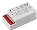
Microwave Sensor (Mounting height ≤8.5m) EBTNLS1-MWS2