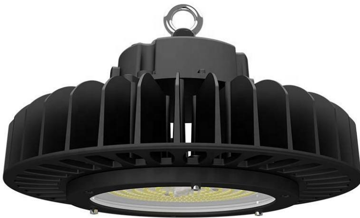
PC Shade KPT-KHBEC1-S6